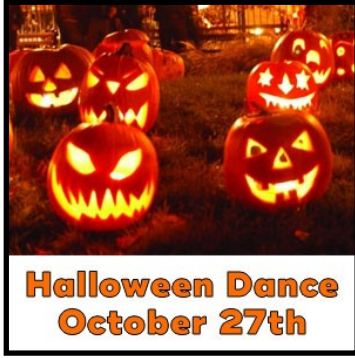
Halloween Dance October 27th

Halloween Dance: The Halloween Dance will be held Friday, October 27th in the BHS Small Gym from 7:00-9:00pm. This dance is for currently enrolled 6th, 7th, and 8th grade students. Students are encouraged to wear costumes, but please remember to follow the dress code and no masks or weapons.