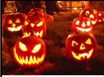
Halloween Dance October 27th